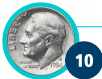
DIMES 10¢ cents