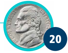
NICKELS 5¢ cents