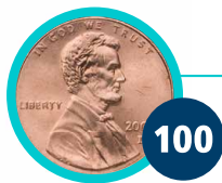
PENNIES 1¢ cent

American bills are the same size regardless of face value. The most common bills are $1, $5, $10 and $20. American coins have the following value: