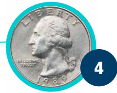
QUARTERS 25¢ cents